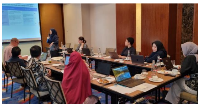
Organizational Capacity Assessment for Castellum Digital Indonesia (CDI).

The process of integrating health services data has many challenges in Indonesia. This includes the fact that more than 80 percent of health facilities across the country are still untouched by digital technology 1 —as